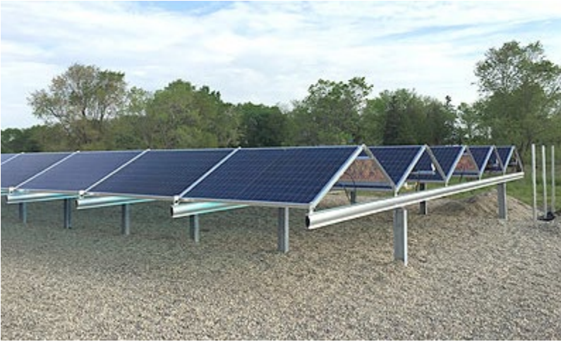
Runestone Electric Association's 44 KW Community Solar Alexandria, MN